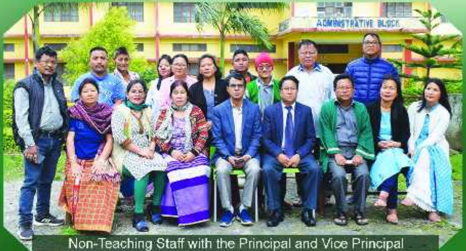
Non-Teaching Staff with the Principal and Vice Principal