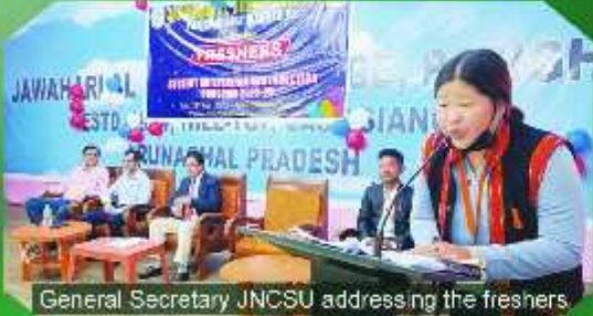
General Secretary JNC SU addressing the freshers