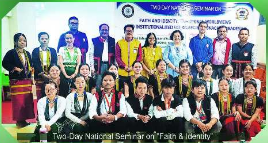
Two-Day National Seminar on "Faith & Identity"