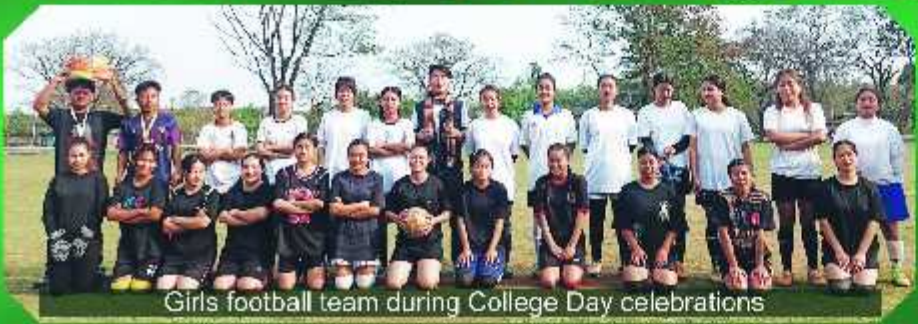
Girls football team during College Day celebrations