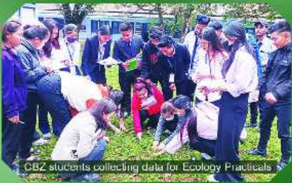
CBZ students collecting data for Ecology Practicals