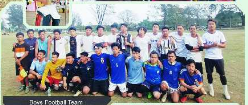
Boys Football Team during College Day celebrations