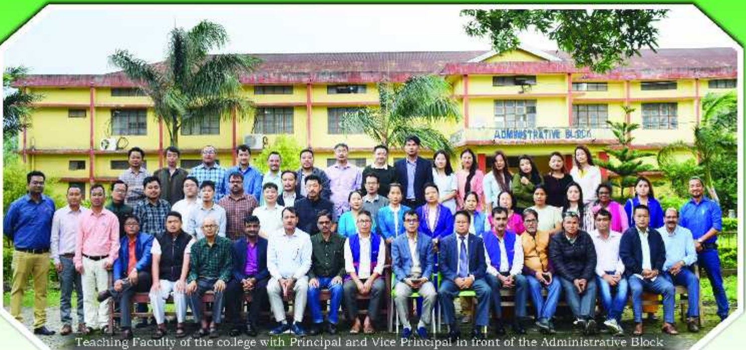
Teaching Faculty of the college with Principal and Vice Principal in front of the Administrative Block

P.O: Hill Top - 791 103, Pasighat, East Siang, Arunachal Pradesh