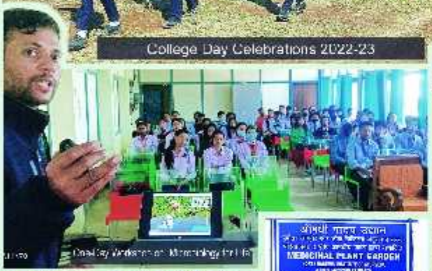
Daily Workshop on Microbiology for B.Sc. students