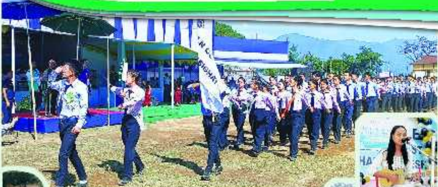
College Day Celebrations 2022-23