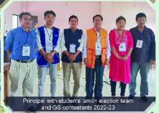
Principal with students' union election team and GS contestants 2022-23