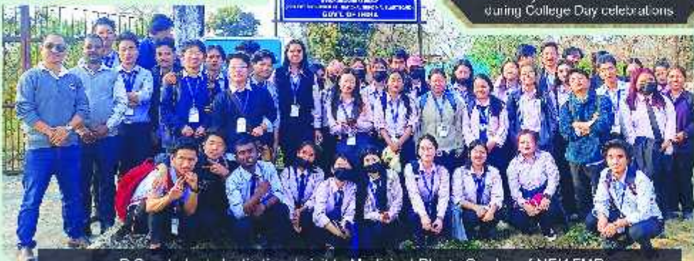
B.Sc. students Institutional visit to Medicinal Plants Garden of NEIAFMR